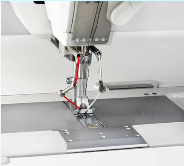
2 Braid arms in front of needle(s)