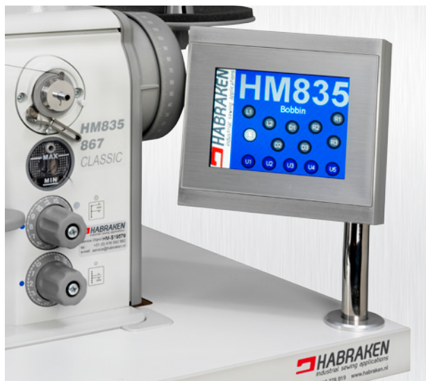
Touch screen operating panel

The HM835 can be supplied with almost all M-Type machines from Dürkopp Adler such as Flatbed, post bed, and cylinder-arm machines in single and double needle version.